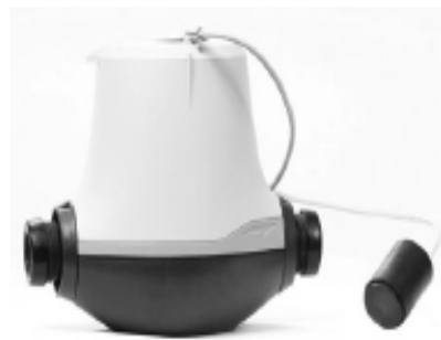
Figure 1- Example of AMI meter

AMI meters, commonly known as “Smart Meters”, are electronic devices that record water consumption and transfer the data via a two way communication system to a central database for analysis and billing purposes, allowing detailed water usage data to be collected continuously at regular intervals and read remotely. Figure 1 shows an example of an AMI meter.