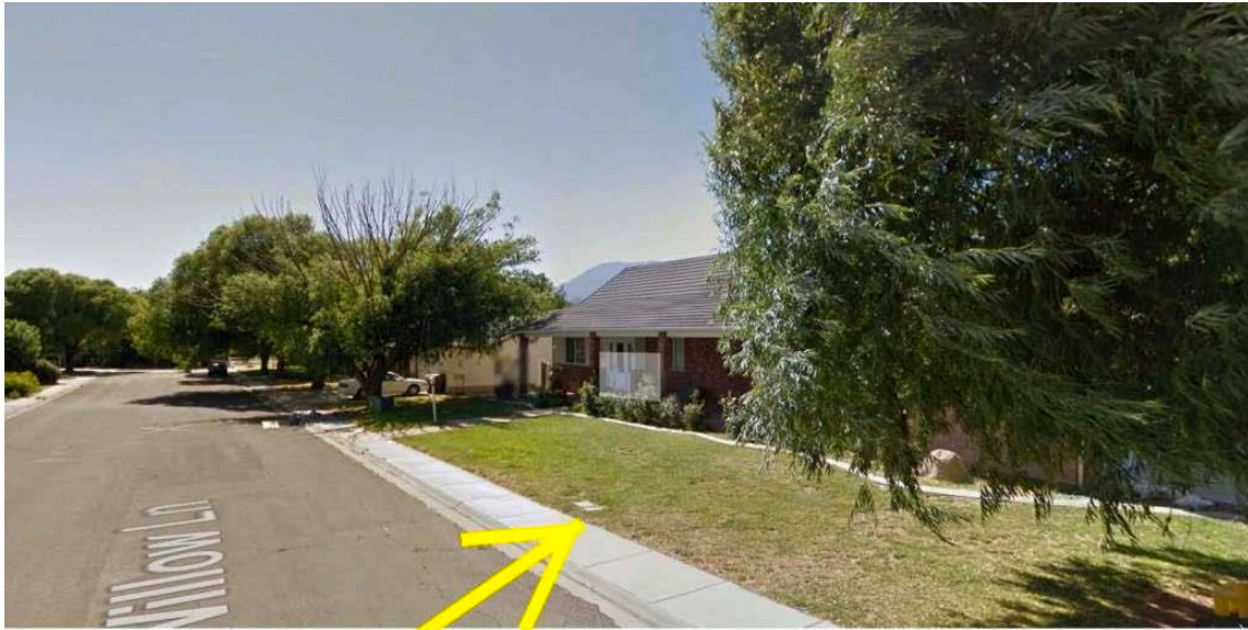
Typical residential Meter Box