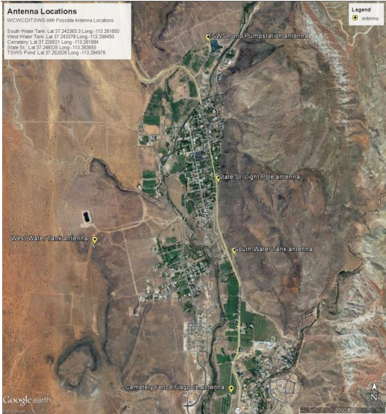
Figure 5 Radio antenna system locations