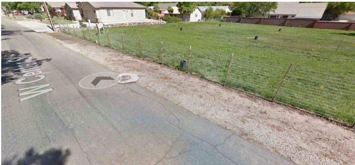
Figure 4 Example photo of agricultural site in Toquerville. Existing underground water valve which supplies this field would be replaced with 2-4 inch AMI meter. Installation of AMI meter would be at edge of pavement